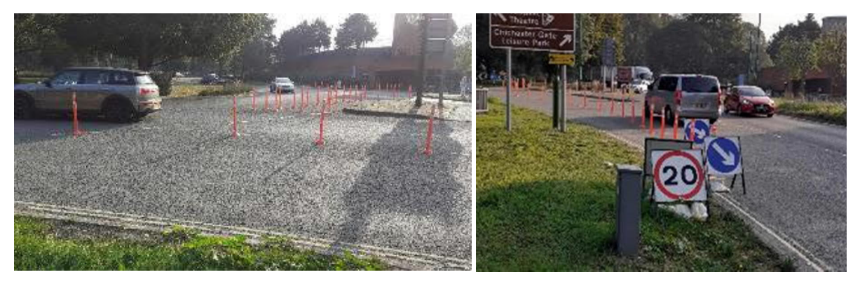
Areas not intended for cycle use, Via Ravenna

This could result in collisions between cyclists and other vehicles, or aggression towards cyclists whereby they might hesitate and collide with each other, or fall off.