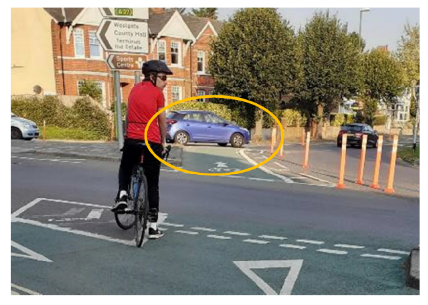
Car giving way at the edge of the cycle lane rather than in advance of it

The line of cylinders forming the edge of the cycle lane across entry points to roundabouts infers that the give way line has been pulled forward to the edge of the vehicle carriageway. This could result in drivers overshooting the give way line into the cycle lane where cyclists could ride into the side of them and be thrown from their bikes.