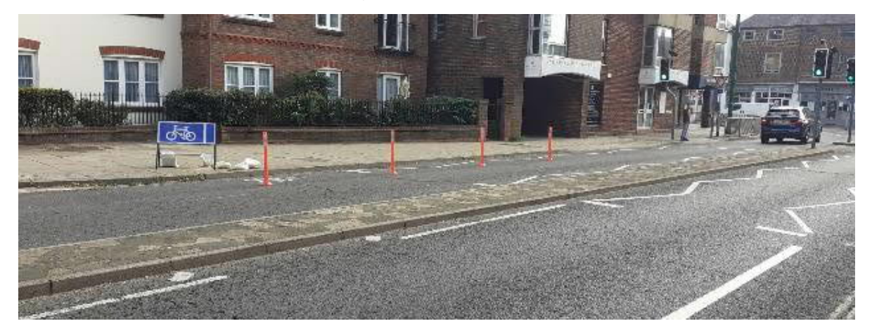
Cycle lane cylinders on the approach to Southgate

The width of the pop up cycle lane is restricted due to the left turn out of Deanery Close and the central island. Cyclists entering the lane will need to travel closer to Deanery Close junction where they may be less visible to drivers exiting the junction. This may lead to vehicle / cycle collisions.