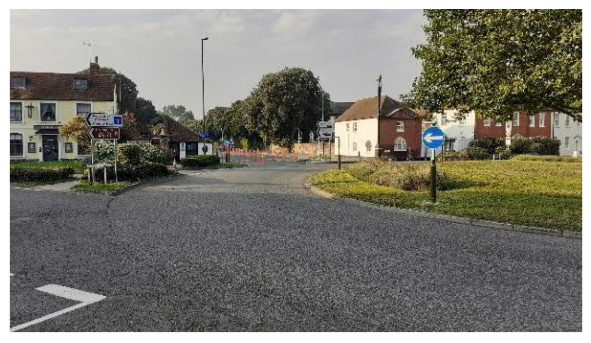
Wands on exit arm of Westgate roundabout to Avenue de Chartres

The location of the wands on the exit arm require a cyclist to align themselves closer to the outside of the roundabout which may lead to reduced visibility of the cyclist from West Street resulting in collisions. Cyclists may change direction to enter the cycle lane on the circulatory carriageway and following vehicles may not anticipate this, leading to side swipe collisions.