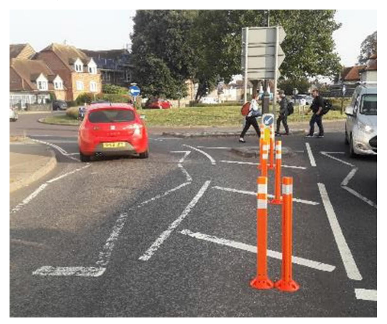
Wands and hatching on the approach to central island on Avenue de Chartres

The revised alignment for other vehicles does not guide them around the splitter island. The only other guidance is the keep left bollard on the small island, which is set back a long way from the kerb of the splitter island and may be hidden from view by the cylinders. The realignment of the traffic lane could result in vehicles striking the island, or sudden manoeuvres to avoid hitting it, resulting in shunts.