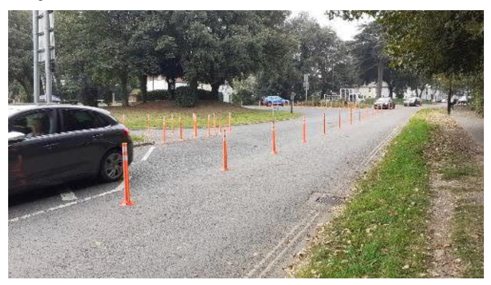
Lack of clarity between areas intend for cycle use, areas closed off, exit point from circulatory carriageway to cycle lane, and intended route for cyclists heading to New Park Road.

Cyclists entering the lane from a roundabout at a difficult angle may fail to turn, hitting the kerb and falling off.