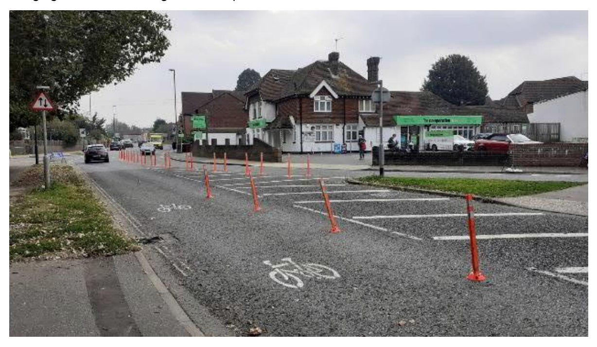
Hatchmarking in general traffic lane, Spitalfields Lane

At the end of the splitter island the cylinders forming the cycle lane end, and additional cylinders on the centre line guide vehicles to merge into the cycle lane. The lane marking forming the edge of the hatching could be construed as a give way line for vehicles merging left, giving cyclists priority. As this is not the intention, it is open to misinterpretation and some drivers may not expect the vehicle in front to stop, resulting in shunts. Some cyclists may believe they have priority over merging vehicles, resulting in side swipe collisions.